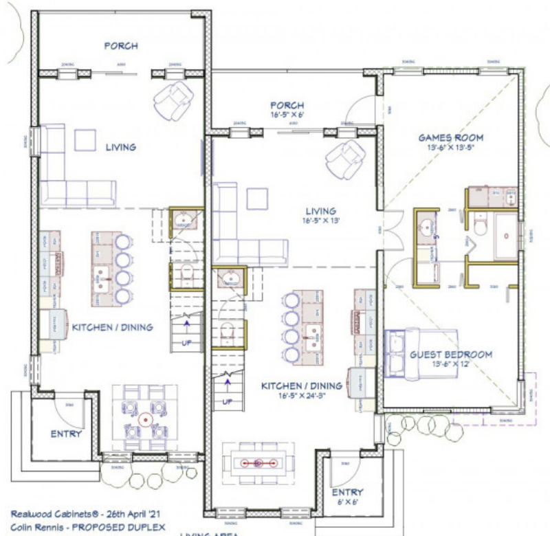
Realwood Cabinets® - 26th April '21 Collin Rennis - PROPOSED DUPLEX Passion Circle Lookout Gardens, Bodden Town, Grand Cayman