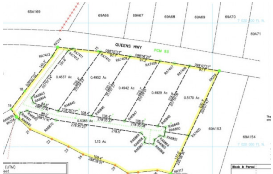
CK 69A, PARCELS 1, 2, & 84.