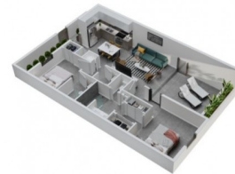
TWO BEDROOM RESIDENCE 847 SQUARE FEET + 200 SQUARE FEET PATIO CI$ 399,000