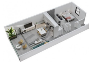
ONE BEDROOM RESIDENCE 636 SQUARE FEET CI$ 299,000